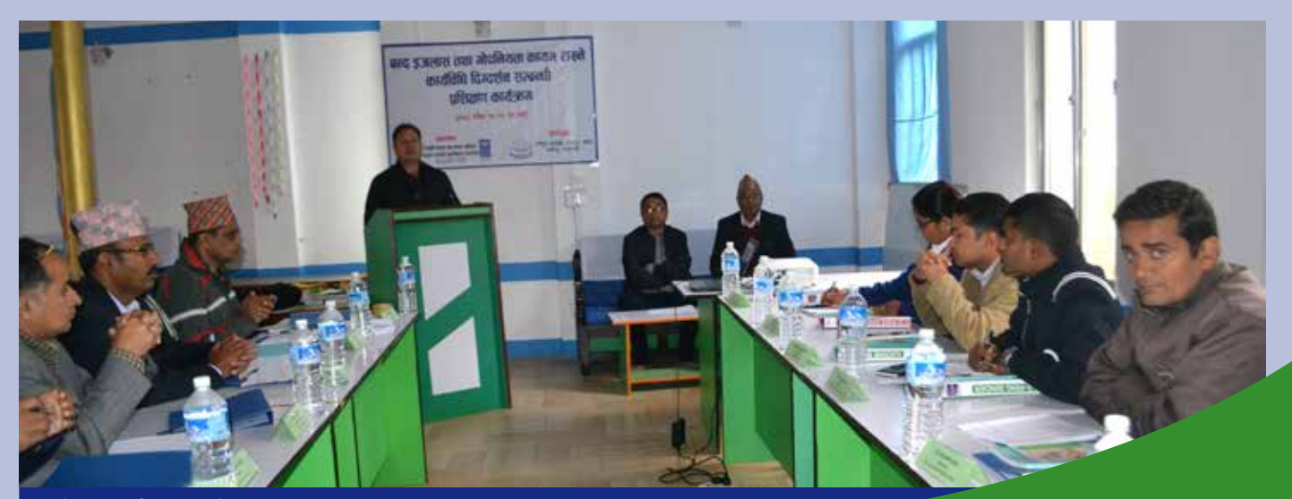
A ghimpse of Inaugural Session

theme of the training was to by law. The training was organized prosecution and program comprised of district