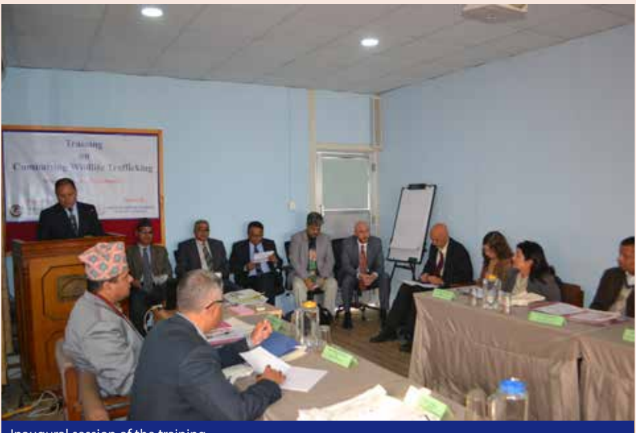
Inaugural session of the training

and sharing individual experiences presentations were also done to make the training more practical and fruitful. There were altogether 24 participants in the training.