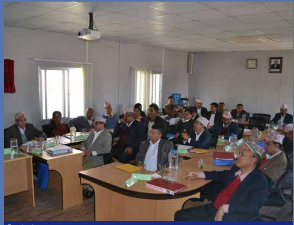
Training in progress

A Three-day training on Strategic Planning and Court Management for Chief Judges of High Court and the Registrars was conducted by NJA-Nepal from Mar. 1 to 3, 2017. The objective of this training was to enhance leadership capacity for the effective implementation of Strategic Plan of Nepali Judiciary strategic plan, jurisdiction of High Courts, management process Altogether 36 Chief Judges of High Court and Registrars were actively participated in this program.